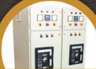
ELECTRICAL PANEL BOARD & INSTALLATION WORKS