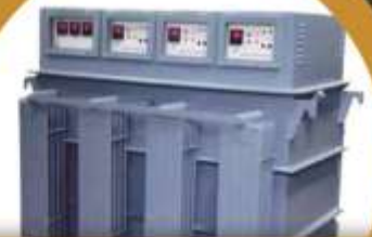
SERVO STABILIZERS & TRANSFORMERS